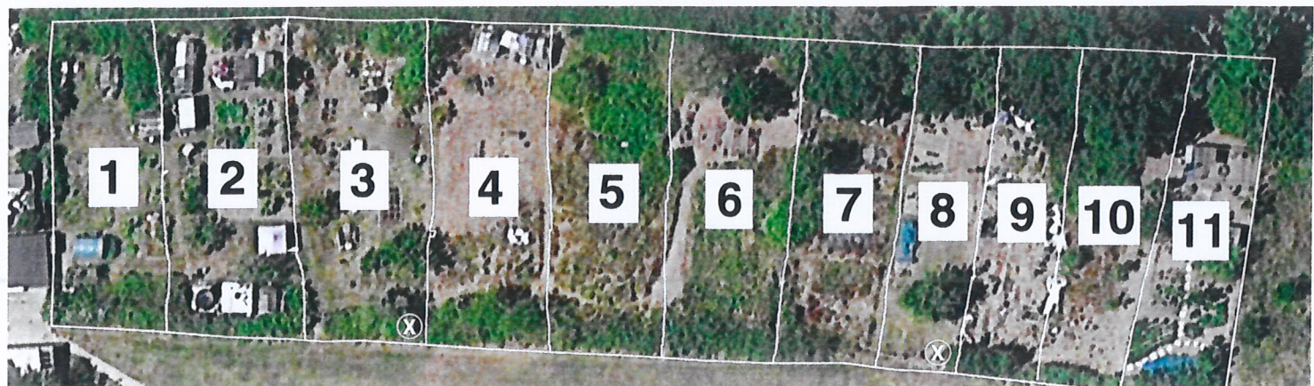
Aerial view of the Harbour allotments showing existing plot numbers