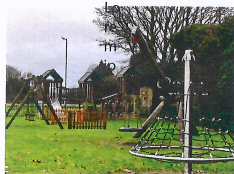
Village Hall Playground

Regular maintenance inspections are made of the sites and equipment alongside an annual independent health and safety audit. The results of these reviews inform repairs and improvements.