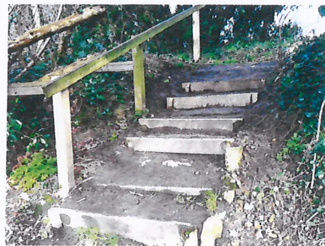
Tumblers Hill steps

To report any faults please use the link below. https://www.kent.gov.uk/roads-and-travel/report-a-problem