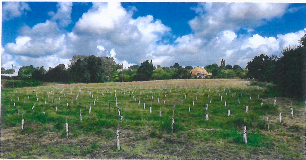
Platinum Meadow showing young trees that will form a future woodland walk

We hope to bring you more information on projects proposed and progress on the Group's work in future newsletters. Our Working Group is made up of councillors as well as parishioners, so if you think this is something you would like to get involved in, do please let our clerk know.