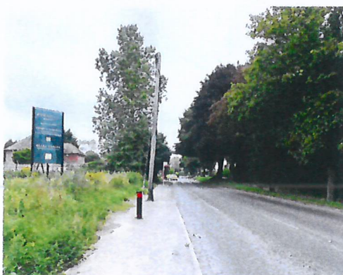
Site of the new entrance to Haven Farm housing development on the A274, Sutton Valence.

We aim to complete the works as quickly and efficiently as possible". For any questions or concerns that parishioners may have, you can contact Fernham Homes at: neighbourlymatters@fernham-homes.co.uk