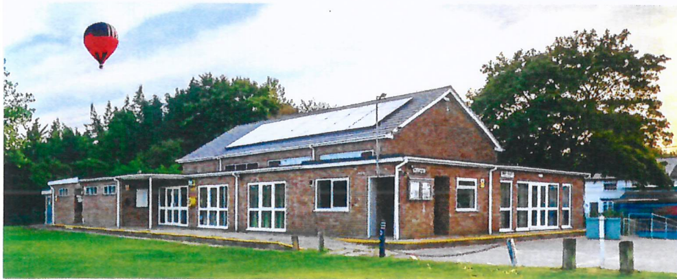
Sutton Valence Village Hall