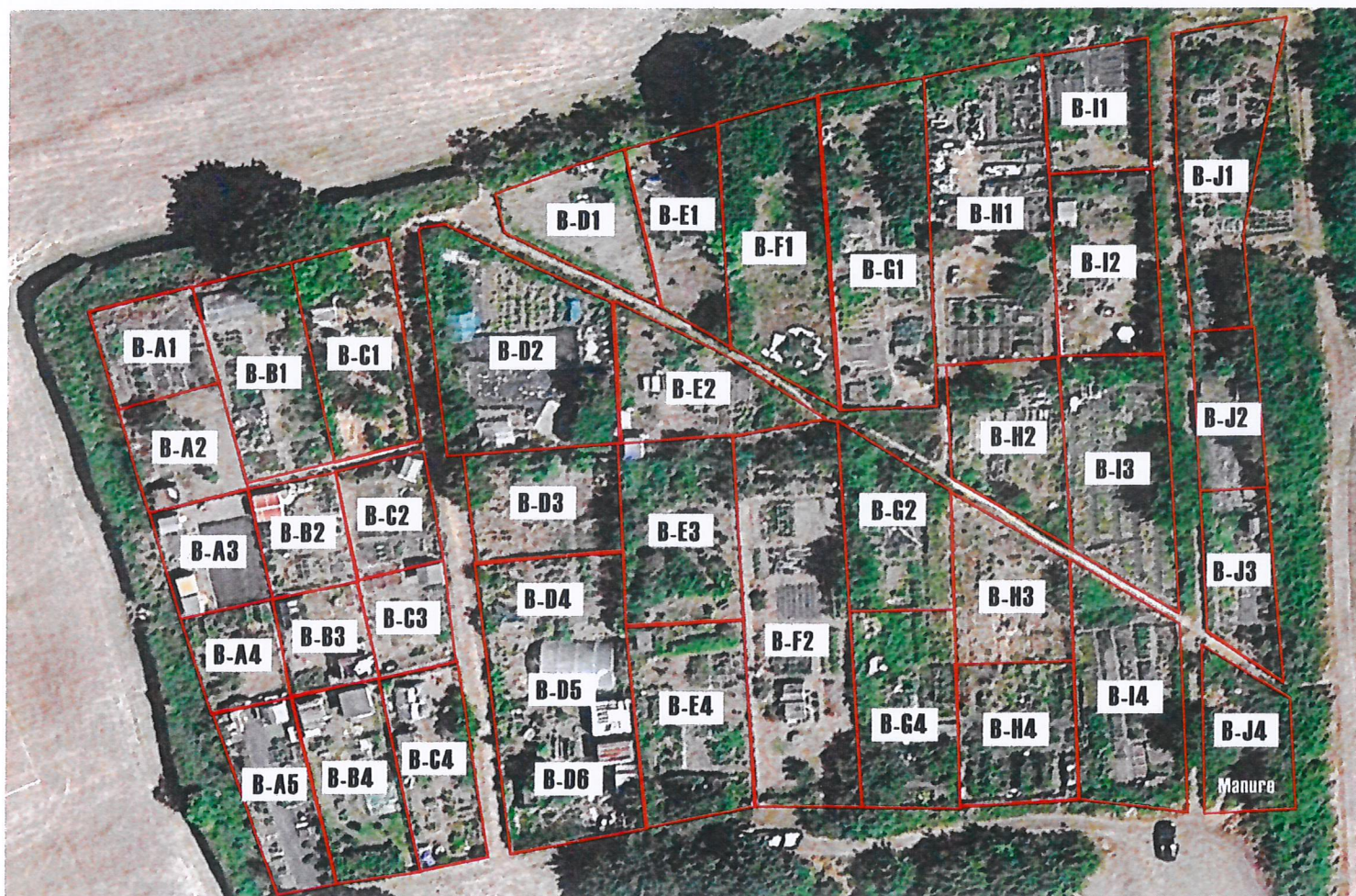
Aerial view of Bowhalls Allotments showing the new plot identification numbers